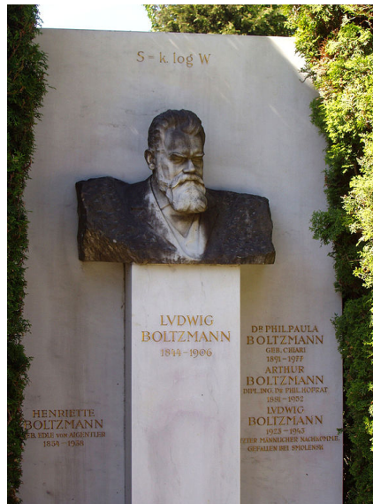
Figure 2: Boltzmann's tomb in Zentralfriedhoff in Vienna.

Boltzmann's tomb is in Zentralfriedhoff in Vienna, a beautiful cemetery that also contains the graves of some of the world's greatest composers, including Beethoven, Brahms, Schubert, Strauss, Ligeti, and Falco. Boltzmann's tomb is shown in Fig. 2. Not the equations, S = k \log W , at the top of the stone.